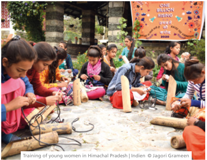
Training of young women in Himachal Pradesh | Indien