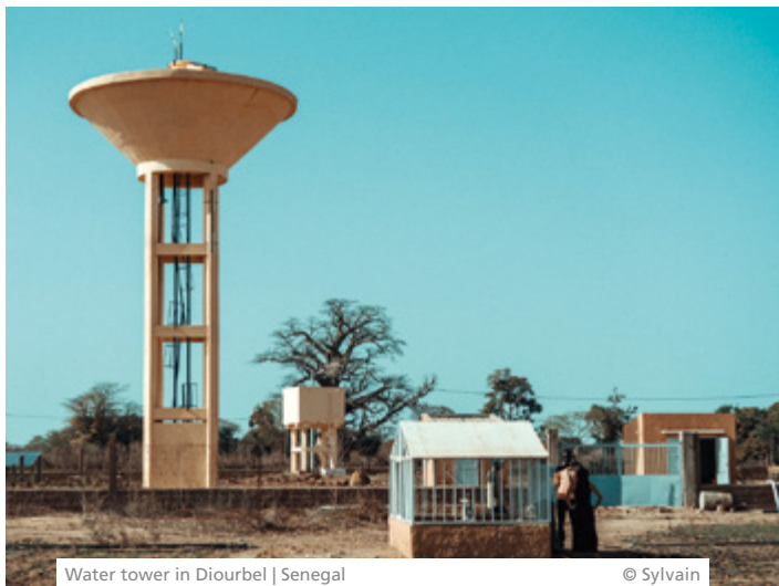
Water tower in Diourbel | Senegal