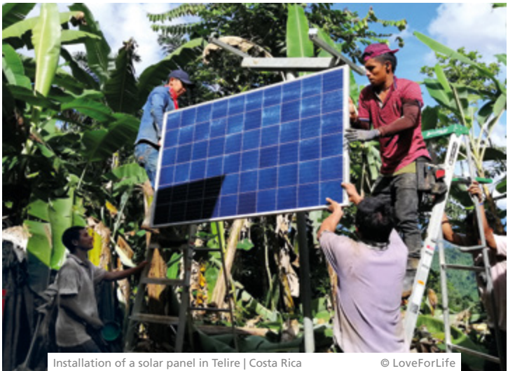
Installation of a solar panel in Telire | Costa Rica